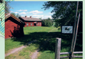
Koversta Old Heritage Village