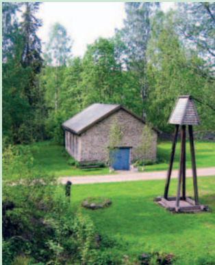
The chapel at Kratte Masugn

At Kratte Masugn (masugn = blast furnace) are prepared nature trails and smaller forestry roads giving the opportunity to create many different walking trails in an old and very interesting ironworks environment with many remnants remaining of the ironworks era.