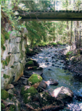
Where the forge in Oppsjö Lake was once situated

4. Sjöängen at Ulvkisbosjön Lake is an interesting area of flora with junipers and wet meadows around the streams traversing the area. At certain times of the year there are different species of orchid to be seen.