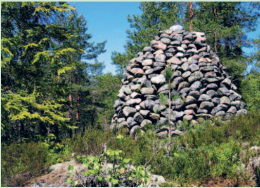
Stone sculptures at Bårhällarna

This is an excellent day trip passing through undulating forested landscapes in the southwest part of Gästrikland. You will also pass a number of shielings (mountain pasture huts). Kungshögshällarnas Nature Reserve consists of beautiful areas of bedrock and primeval pine forest. There is also a lookout tower. The circuit also passes the Bårhällarna area with its curious stone sculptures. A good starting and finishing point for trails is Ulvkisbosjön Lake.