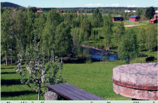
Bresiljeån Stream as seen from Bunges Chapel

From Jädraås is a 50 km long offshoot of the Gästrikeleden Trail to Lingbo. On this part, which is a connecting trail to the Hälsingelden Trail, are many beautiful areas. Approximately eight kilometres north of Jädraås is Mocksjöberget Mountain. There are remants of the Långfäbodarna shielings here. After a further six kilometres the trail connects with the Kölsjöån Stream and accompanies it along the last part of the trail to Åmot. Directly north of Åmot is the Björnspåret Track, which is an undulating trail circuit of seven kilometres connecting with the Gästrikeleden. Along Björnspåret Track are prepared rest areas and spots with some great views.